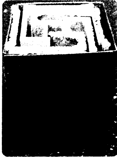
Figure 1. Post Test Unpainted Newmat Aluminum Rail Showing Interlocking Pieces Used to Form Complete Sample. (Note white ash covering sample – typical of all four runs.)

ASTM E 136-99 e1 cites pass/fail criteria in which a passing value from at least three of four specimens tested in reported when